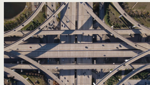
Intersection of Business and Government